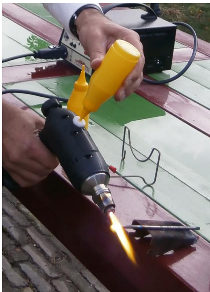
Mini-plasmatron smelts Tungsten (3500 °C)